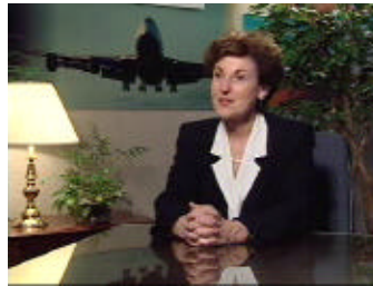
Jane Garvey Administrator Federal Aviation Administration