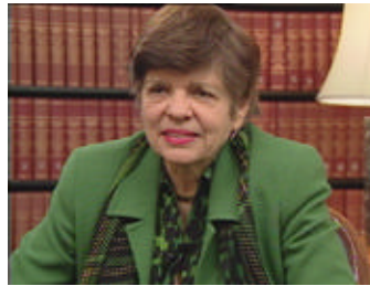
Alice Rivlin former Vice Chairman of the Federal Reserve Board